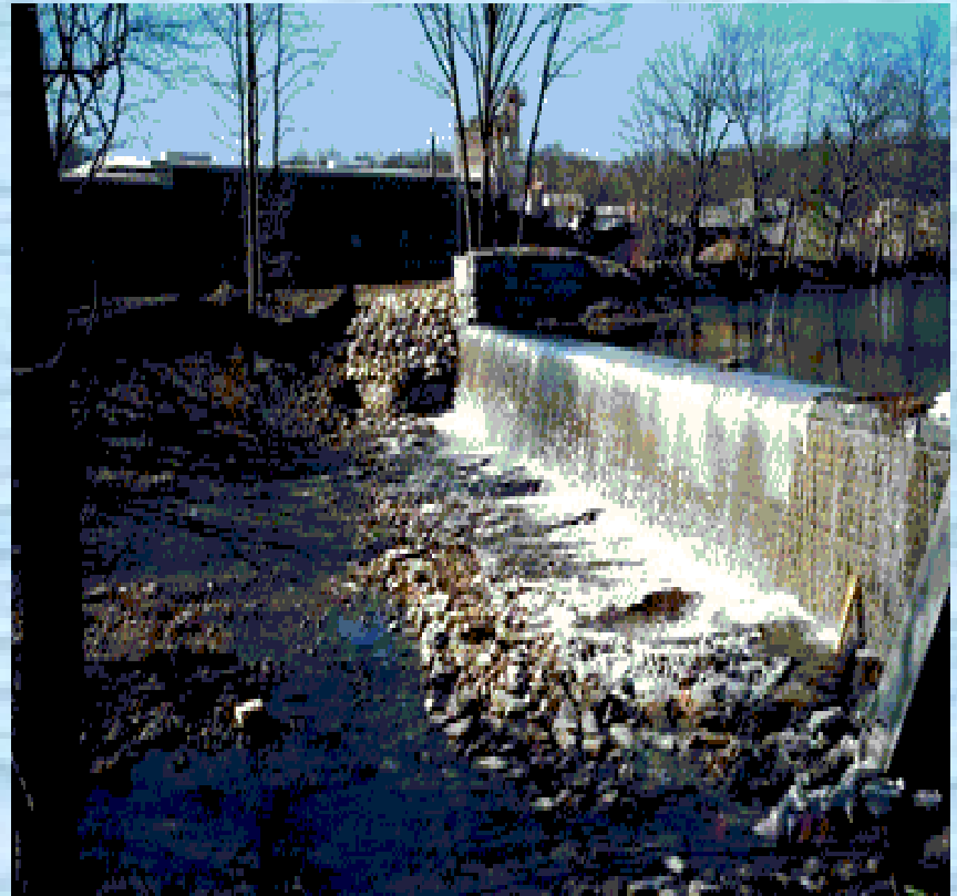
Reconstructed Allendale Dam

What is planned for the future ( fish passage )