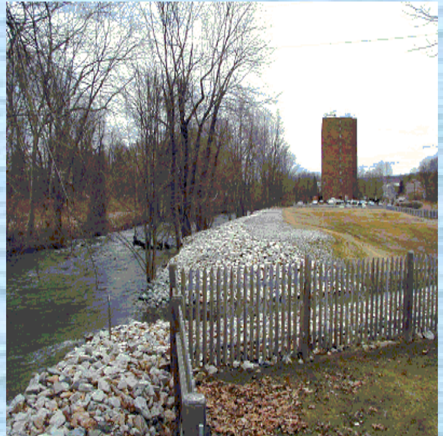
View of the Centredale Site looking North along the Woonasquatucket River