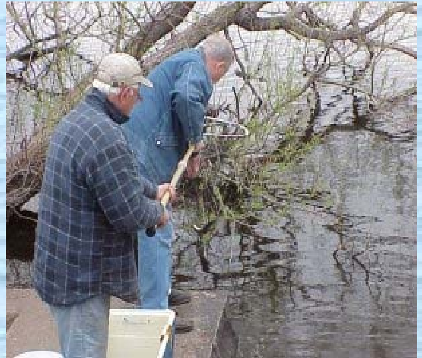
Fishermen assist herring over the dam At Omega Pond